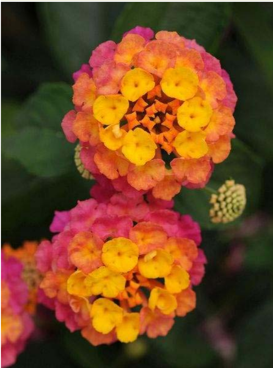
Lantana 'Lucky Sunrise Rose' (Ball Horticulture)